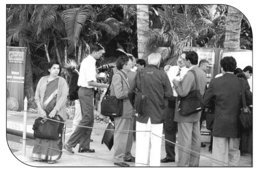
Tea Break on