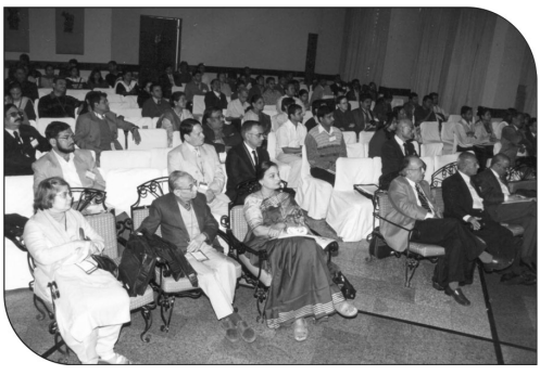
Session on at Kautily Hall